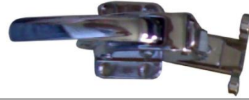
KAPI KİLİDİ / DOOR LOCK