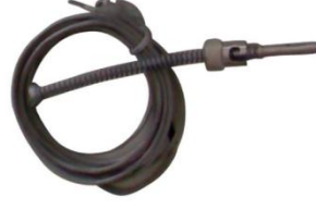
MT 100-1J 08